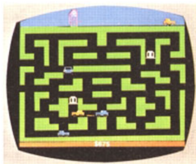
FLAT BROKE, ARKANSAS