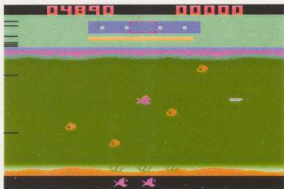
The seas get more crowded

Okay, that's one monster down, rush to the next and do the same to him (remember, your energy is always dropping so don't hang around).