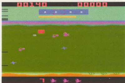
Our heroic fish takes on a monster

Not only that, but if you still have time left and your bar is full, all of the monster's remaining energy will be used to rack up LOADS of points for you!