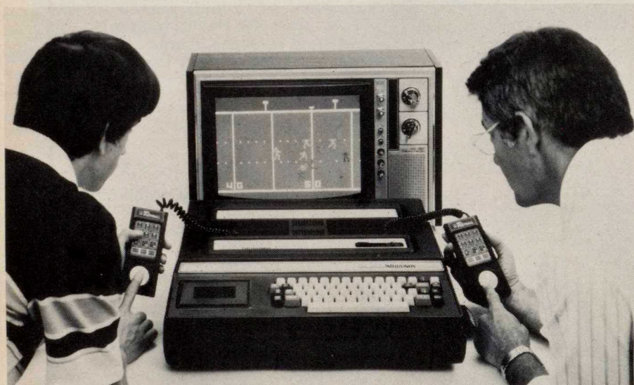
Arcade Alley's proprietors have judged Intellivision "the state of the art . . . the best unit offered so far to game players."

Mattel's recent introduction of its Intellivision computer system has turned the video game world topsy-turvy. A single session at the controls of this second generation programmable game-player will convince even hardened skeptics that home arcades will never be quite the same.