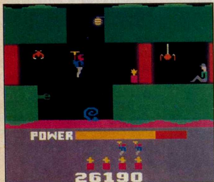
'Rod Hero' to the rescue in 'H.E.R.O.'; striking gold for the Atari 2600.

Conceiving games around identifiable and individualized characters has become more common in the last year or so. The desire to exploit licensed properties like "Pac-Man," "Donkey Kong," and the "Smurfs" is a factor, but the most important reason is undoubtedly the simplest: players