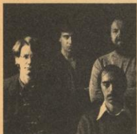
Sydney Software, adapters for Colecovision®