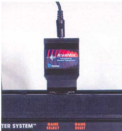
Insert the AtariVox into the second controller port

A USB development interface will soon be available, allowing speech construction (via the utility - www.vectrex.biz/AtariVox_utils.zip ) and also access to the flash memory (for back-ups, etc). A web page with programming examples / tips is also in the making. Please visit AtariAge.com to keep abreast of AtariVox developments.