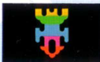
SHIELD BLASTERS (SHOOTERS)