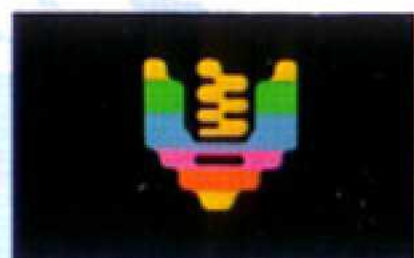
DELTOID BLASTERS (SHOOTERS)