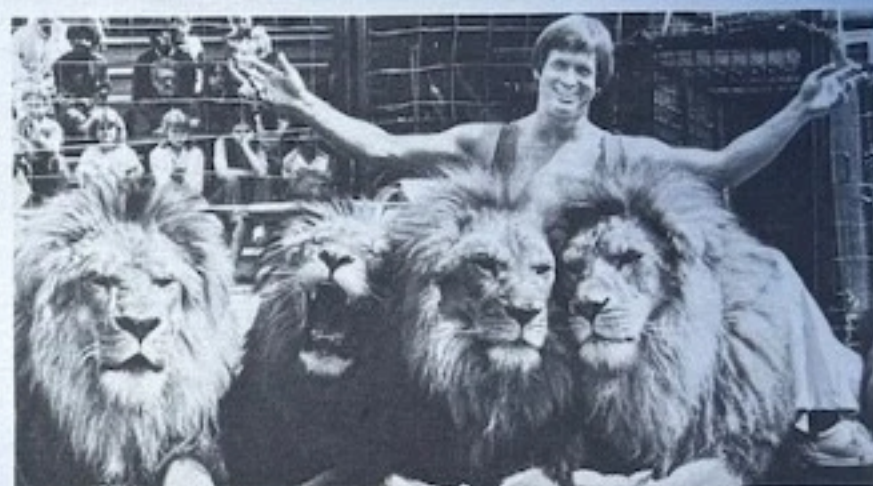
Why not pause to see the Lion Show at Marine World/Africa USA during Atari's Family Fun Day, Saturday, October 16. You'll just roar with delight when we tell you the prices for park admission: adults, regularly $9.95, only $6.50; children, regularly $6.95, only $4.50. Buy your tickets now at all three Company Store locations.