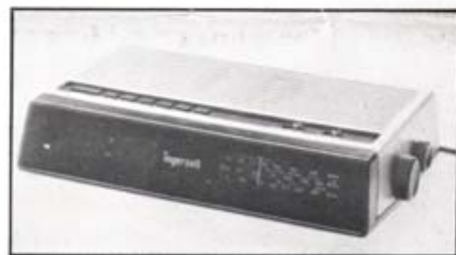
3RD PRIZE INGERSOLL ELECTRONICS XK800 LED CLOCK RADIO - wake to radio or a buzzer. Worth around £30.