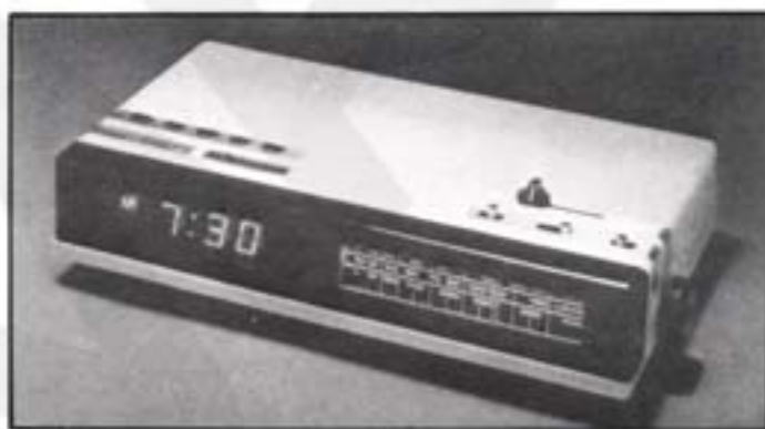
2ND PRIZE INGERSOLL ELECTRONICS XK805 3-BAND CLOCK RADIO - for accuracy and reliability. Worth around £35