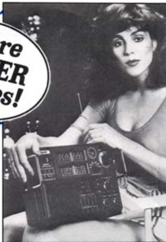
1ST PRIZE INGERSOLL ELECTRONICS XK700 7-BAND "PROFESSIONAL" RECEIVER - also incorporates an LCD clock with memory alarm. Worth around £180