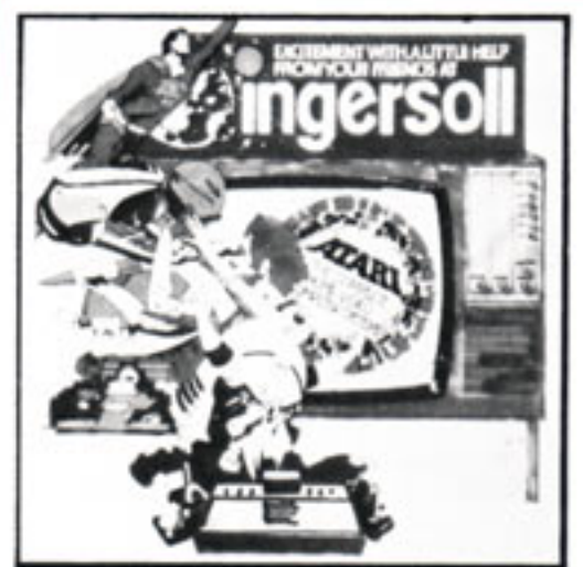
Look for these displays in shop windows

The best three Owners' entries will receive a new Ingersoll Electronics Soundaround hip-pocket stereo (no, you don't get the girl or guy as well!) - and we'll make sure the shop's Manager gets a little something as well.