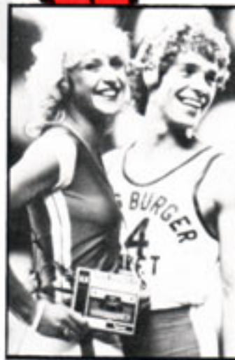
Ingersoll Electronics' new Soundaround.

At this time of year, the shop windows are full of Ataris! We thought it would be a nice idea if we had a photographic competition based on our dealers' decorative efforts, and your sharp eyes for spotting the best displays.