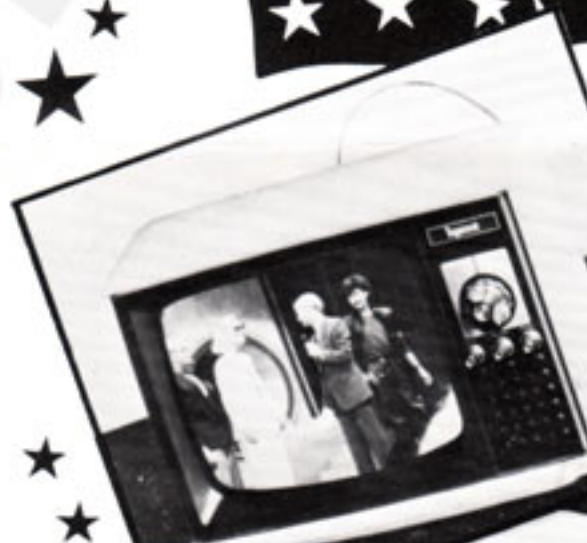
INGERSOLL ELECTRONICS PORTABLE TV

Our first prize, Overall, is a Week for two in America!