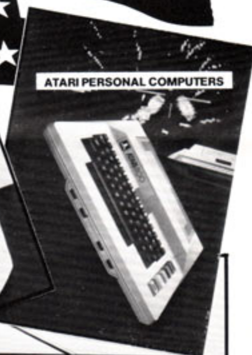
ATARI PERSONAL COMPUTERS