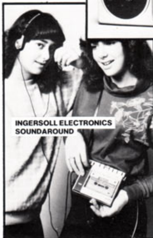
INGERSOLL ELECTRONICS SOUNDAROUND