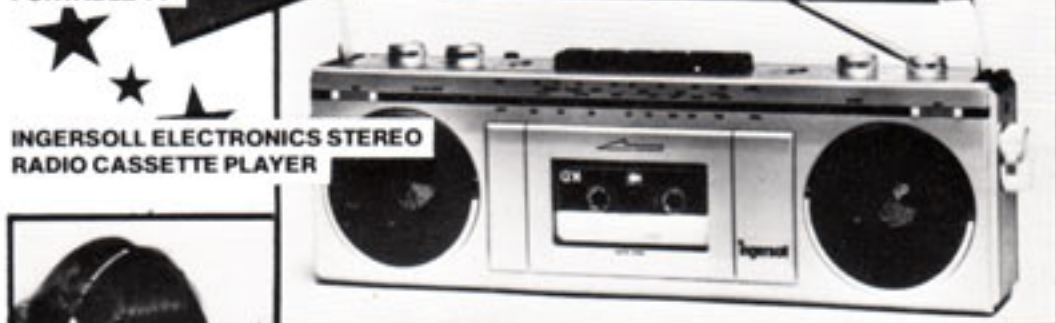
INGERSOLL ELECTRONICS STEREO RADIO CASSETTE PLAYER