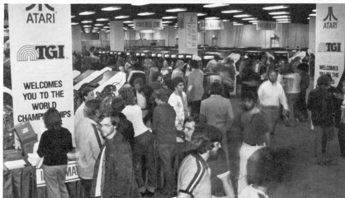
A bustling crowd gathers at the entrance to the ATARI World Championships for video games.